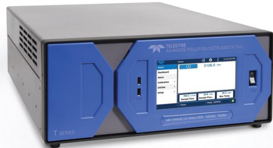
Figure 1: T300M - Mid-range CO Instrument

Extensive research and development has gone into the T Series line of gas instruments to ensure high uptime and data capture to a CEMS