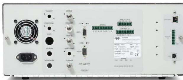
Figure 2: Rear Panel of T300M

Several communication options in the T Series allow for seamless integration into most CEMS. They include: Ethernet, RS232, USB and analog output communications hardware combined with MODBUS and Hessen communication protocols. Figure 2 shows a typical CO instrument rear panel. Digital status output assignments as well as polarity can be defined by the user. Remote monitoring and control are also possible using TAPI software called NumaView™ Remote, provided at no additional charge. A built-in data acquisition system in the T Series can store up to two years' worth of data and provide valuable troubleshooting information which helps get to the source of the problem quickly.